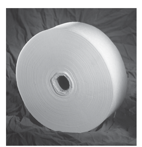
396 Sheathing Tape