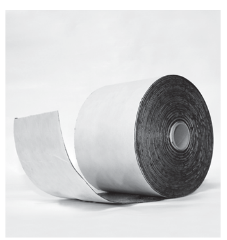
365 Flashing Membrane